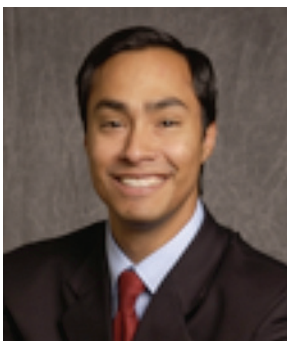
The Honorable Joaquin Castro , Vice-Chair, House Higher Education Committee